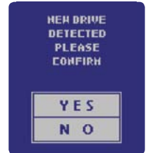
No Software or Drivers Mac, Linux and Windows Compatible