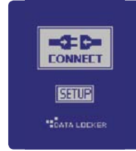
USB 3.0 Interface (USB 2.0 Compatible) No External Power Required