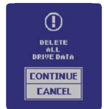
Rapid Secure Wipe Self-Destruct Mode (Optional)